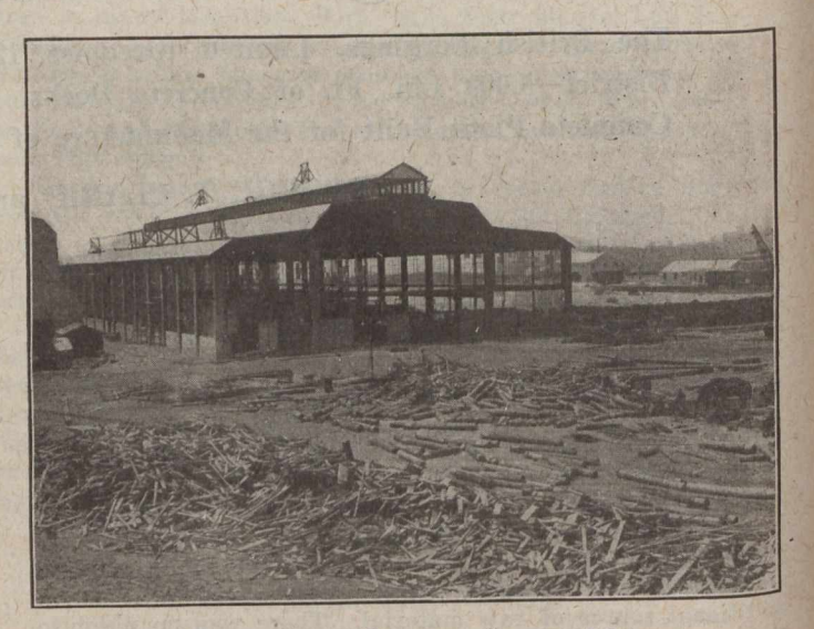
FORGE SHOP NEARING COMPLETION

Particular attention was paid to the furnace foundation of the melting house (steel plant) in order to secure a proper distribution of the loads. This was required on account