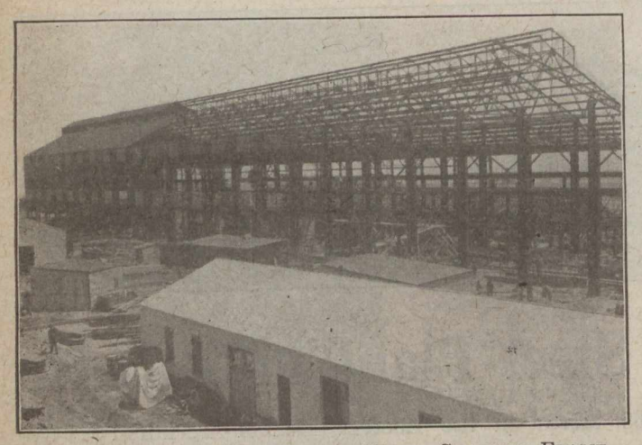
CONSTRUCTION OF THE MELTING HOUSE, SHOWING FRAME-WORK OF THE FURNACE OPERATING GALLERY-STOREHOUSE IN THE FOREGROUND

The elevation of the original ground, at the point where this plant is now erected, was about elevation 243.0 above mean sea level of New York harbor, or approximately two feet below zero of the Toronto Harbor Commissioners'