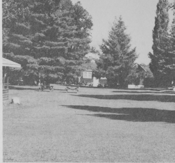
The Long Island Summer Camp is an undeniably beautiful and peaceful spot, to which these two views will attest. Left is a view from across the Rideau River near the Long Island Locks, and right, several of the cabins.