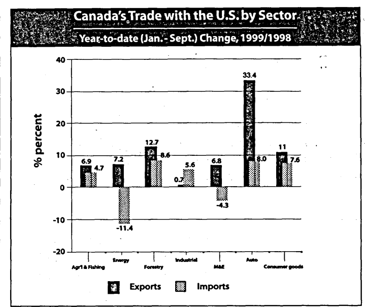
Note: Calculations were based on Customs Basis Data, Not Seasonally Adjusted.

The acceleration of U.S. real GDP in the third quarter to an annualized rate of 5.5% was largely due to increased consumer spending, a jump in business fixed investment (mainly spending on software and equipment), and renewed inventory building. Some of these developments translated into higher demand for Canadian goods and services.