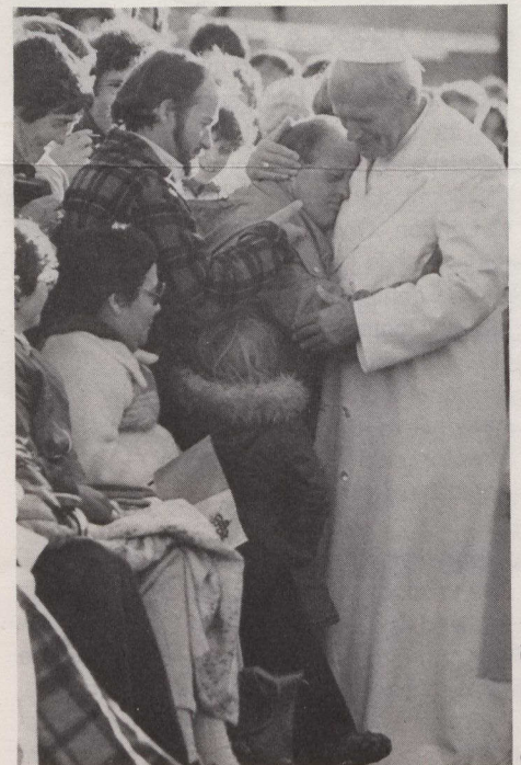
An embrace by the Pope as he enters the open-air mass site in Edmonton, Alberta.

John Paul's affinity with the young and disabled was evident in Halifax, Nova Scotia,