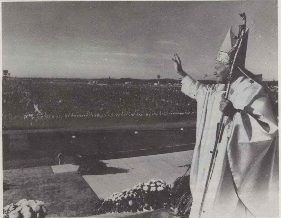
Pope John Paul waves to the crowd during the open-air mass at the airfield in Namao, Alberta.

Thousands greeted John Paul as he drove along the streets of Quebec City, and later approximately 300 000 people