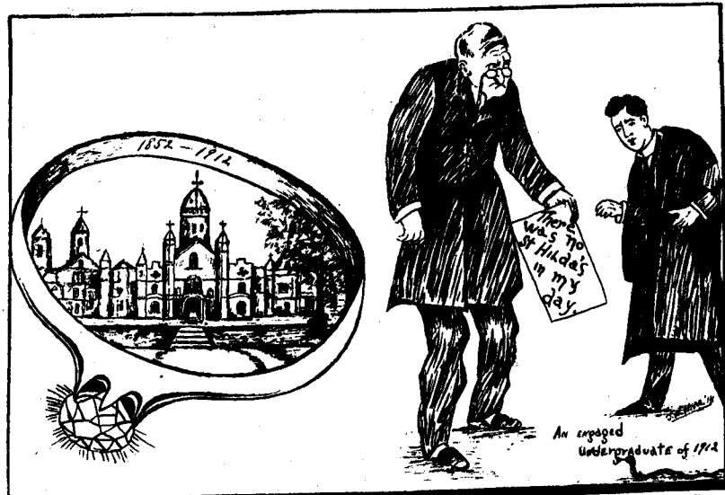
TRINITY CELEBRATED HER DIAMOND JUBILEE JAN. 15 th 1912.