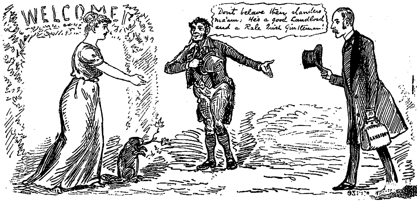
OUR NEW GOVERNOR—CANADA GENEROUSLY WELCOMES.