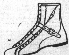
Ladies' and Girl's Hockey