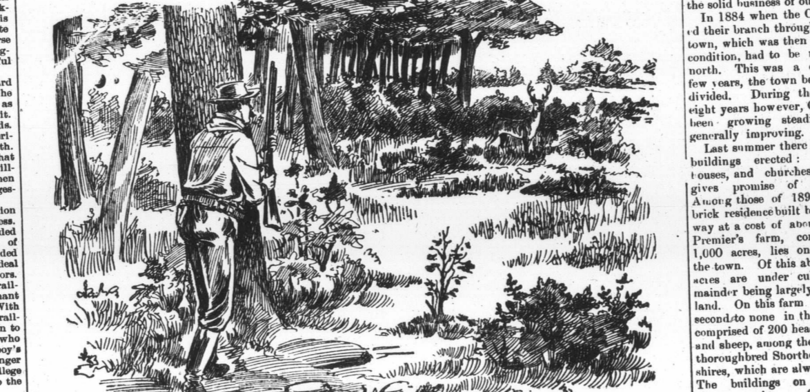
THE FISHER BOY'S TRYING ORDEAL.

In conclusion, we might add that we have found the climate most delightful, healthy and the weather has been of the very best all winter.