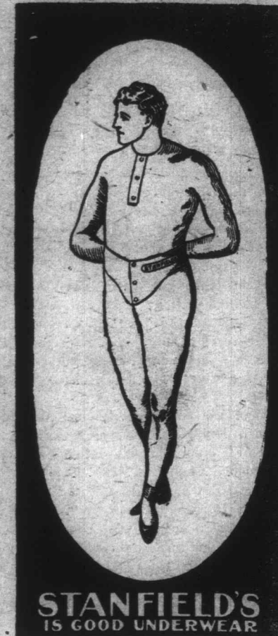
STANFIELD'S IS GOOD UNDERWEAR