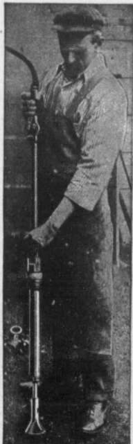
Pneumatic Sand Rammer.

PLEASE ADDRESS ENQUIRIES TO NEAREST SALES OFFICE