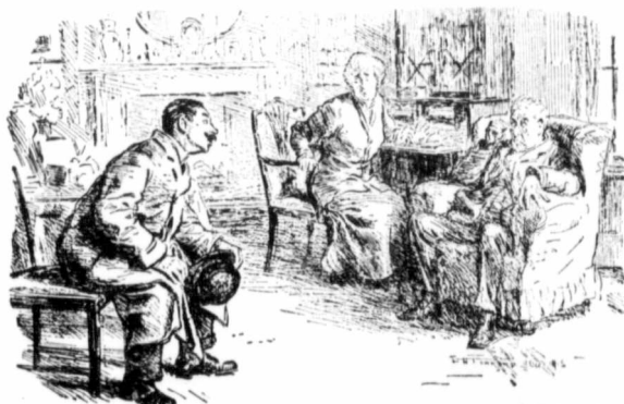
Old Gentleman (engaging new chauffeur): "I suppose I can write to your last employer for your character?" Chauffeur: "I am sorry to say, Sir, each of the last two gentlemen I have been with died in my service."

Do not get the idea that the Canadian Thresherman and Farmer advocates indiscriminate buying of automobiles by farmers. Far from that, caution, extreme caution is advised. If you do not need and cannot use an automobile do not think of buying it. We would give the same advice regarding tractors or any other expensive equipment for the farm. If you can make it pay and can pay for it, buy it, otherwise look at it but let it alone.