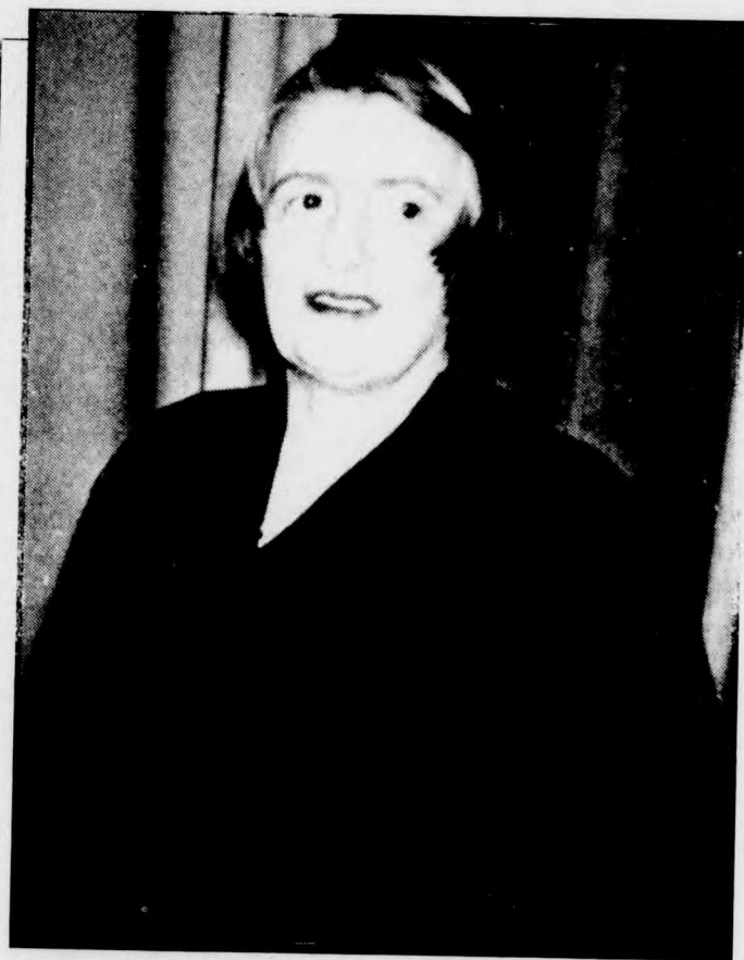
Pictured above, Ayn Rand, the founder of the philosophy of Objectivism. Her writings gained a large audience, but have failed to be regarded as legitimate philosophy within academic circles.