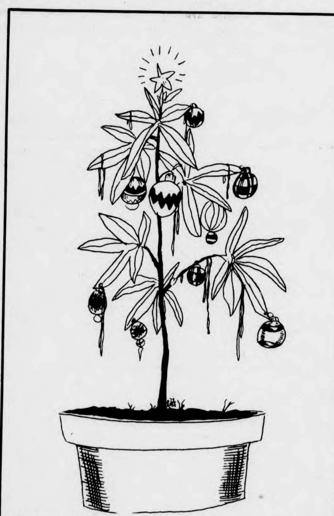
To be sung to the tune of The Twelve Days of Christmas

Our last meeting staff meeting this year is at 2 pm. Everyone is welcome. Merry Christmas.