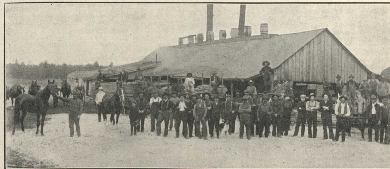
Noon Spell at the Saw Mill.—Prince Albert, Sask.

The main street of Prince Albert is perhaps the finest in the whole valley, since it fronts along the river with no buildings to shut out the great water-escape here half a mile in width. Not for scenery or history alone is Prince Albert conspicuous in the traveller's eye. The town is busy. With the coming of the railway, industry once languishing has sprung to life. The great spruce forests of the upper Saskatchewan and the northern rivers find their way to the Prince Albert saw-mills. An illustration of the magnitude of this industry is afforded by the accompanying views.