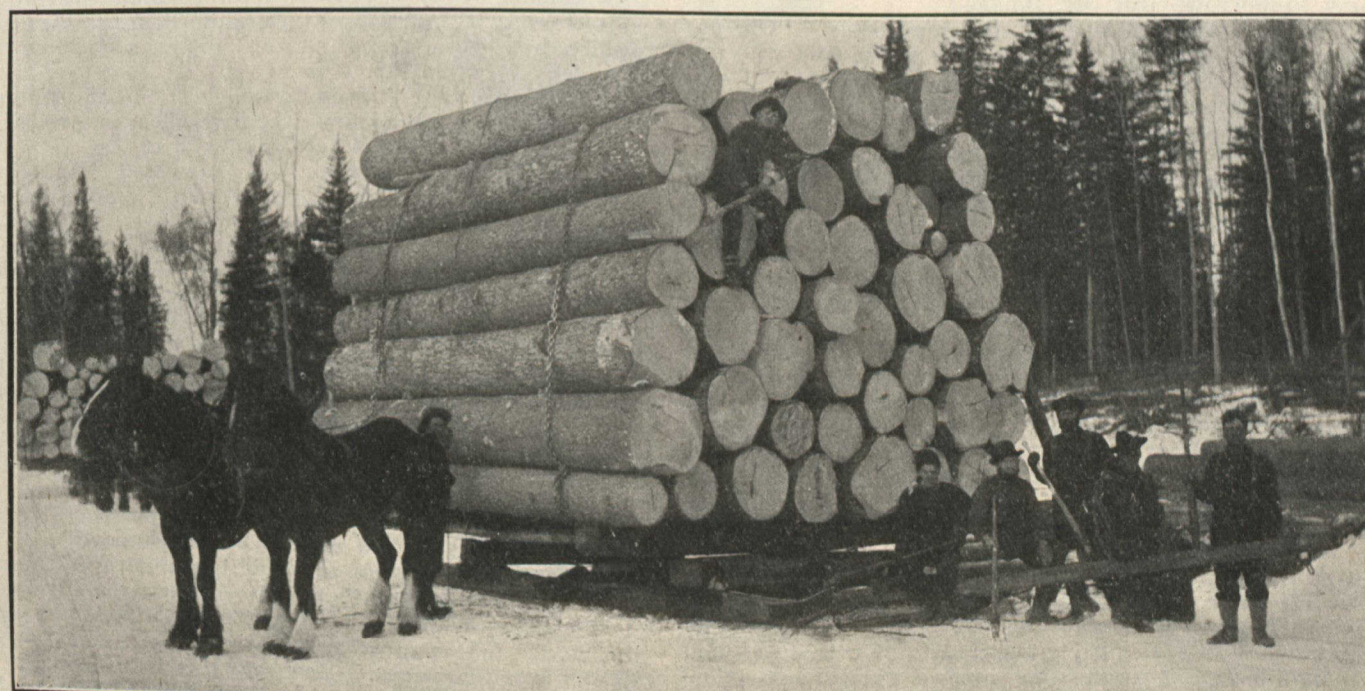
Nowhere in the world can a team of horses draw more than on the hard snow roads of the Saskatchewan Valley.

SOME INTERESTING PICTURES FROM THE CITY OF PRINCE ALBERT.