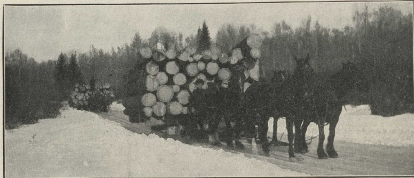
Load of Forty Spruce Logs on its way out of the woods, near Prince Albert, Sask.