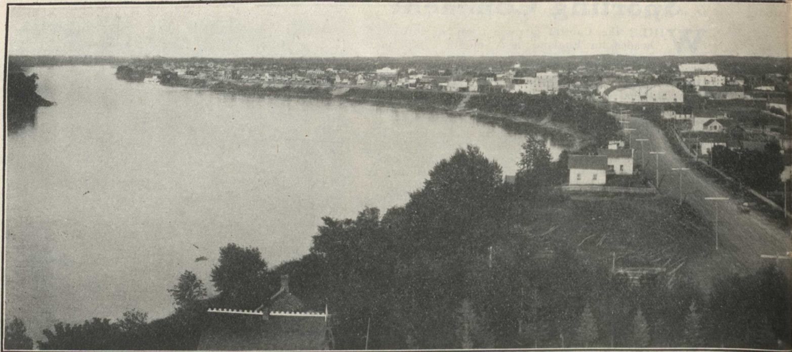
General View of Prince Albert, looking down the Saskatchewan, showing the Main Street along the Bank, and the beautiful Residential Hill in the rear.