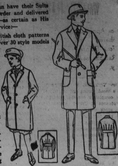
Pitch-Back Top Coat for Boys

Try our "Special Order" Semi-ready Tailoring—for it is wholesale Custom Tailoring on modern efficiency standards.