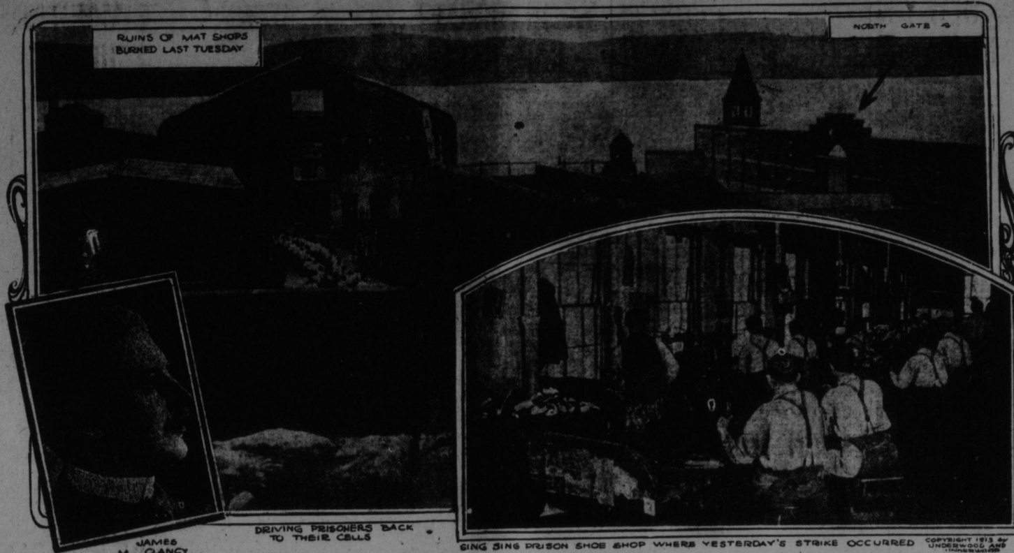
Two attempts were made to destroy Sing Sing Prison, and a strike of one hundred sullen felons, which nearly precipitated a quick test of strength between guards and convicts, marked the progress of insurrection among the fourteen hundred prisoners.