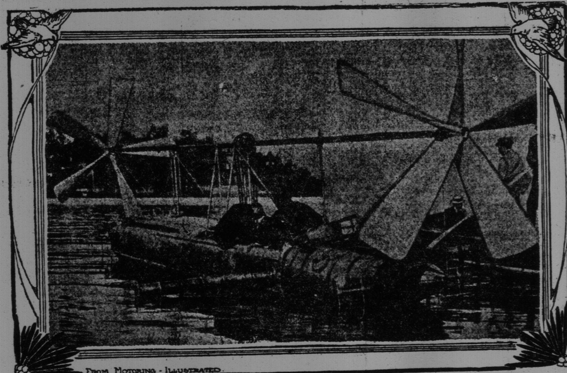
LATEST EUROPEAN MILE-A-MINUTE MOTOR-SKIMMER BOAT

Many experiments have recently been made, says Motoring Illustrated, with flat bottomed motor boats of the skimming or "ducks and drakes" type. The latest "skimmer" is shaped like a thickened cigar. It has a seventy horse power motor, which, instead of driving a screw, revolves huge fans at either end of a shaft running the length of the vessel. According to report, marvelous results have been achieved, the inventor, M. Forlanini, having attained a speed of 43 miles an hour. Even travelling against the wind and on days when the lake was rather rough (the experiments were made on the Lake Maggiore) the boat going at full speed kept a most regular march, hardly breaching the water, and almost flying over it. The inventor, though he does not claim to have solved the aerial navigation problem, thinks that his early experience indicates that a successful flying machine can be built on these lines. His experiments have been made on Lake Maggiore. About two years back we described a fan driven boat in use on a French weed infested river.