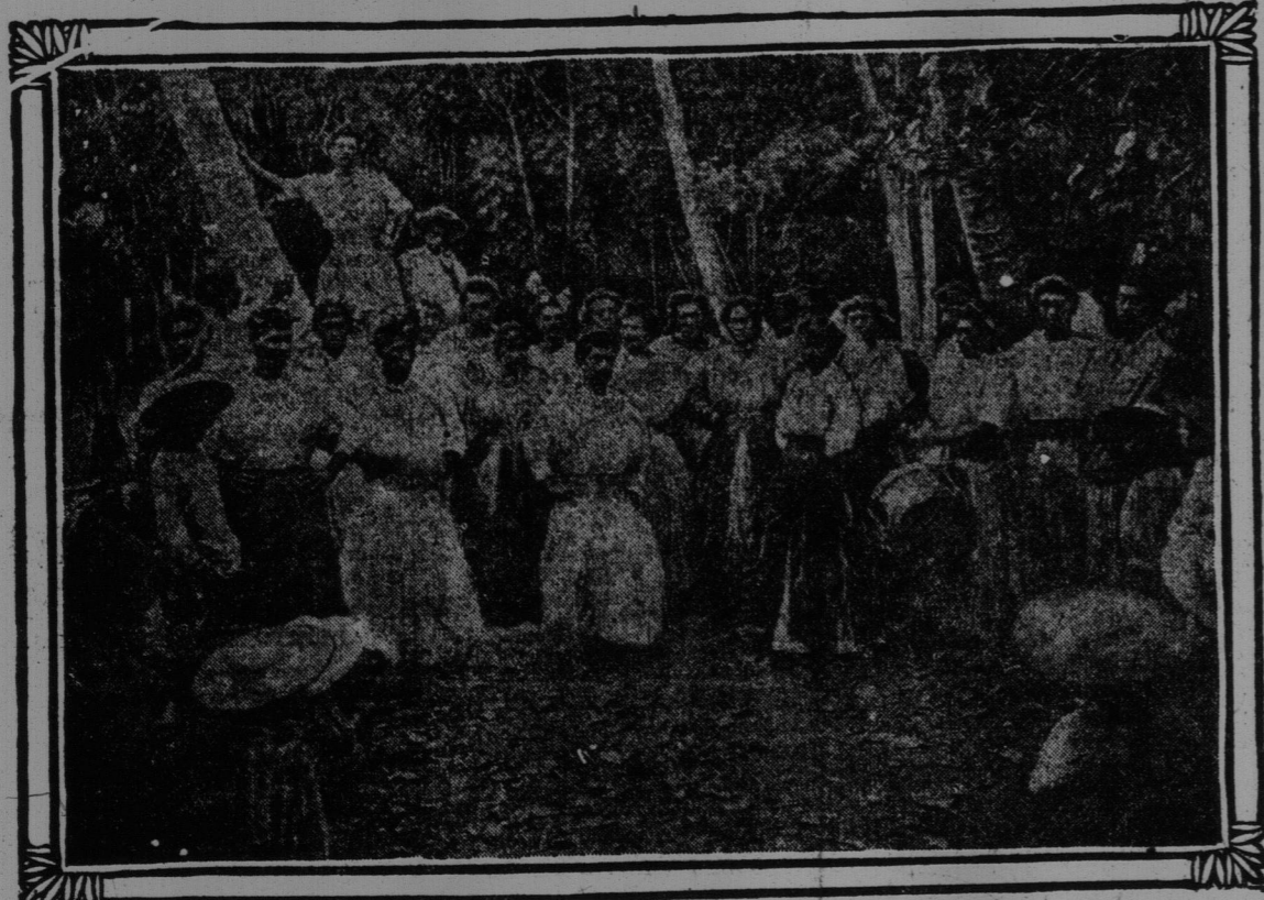
GROUP OF TAHITI-DANCERS NOW IN THE UNITED STATES.