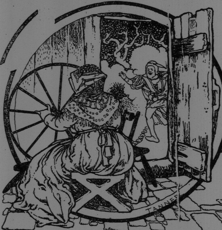
Robin Hood is saved from the Sheriff by the little old woman. Find the sheriff.