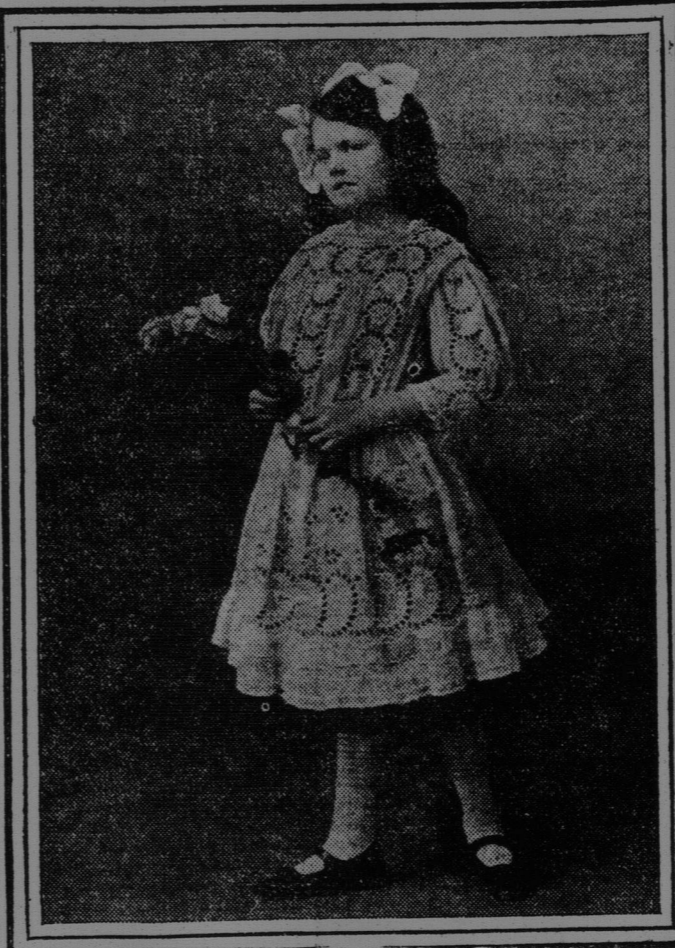
SMALL GIRLS WEAR EMBROIDERY MUSLIN FROCKS.

Bold embroideries in muslin frockings and bands are extensively utilized for children's frocks. Often the skirts are formed entirely of flouncing, and sometimes lengthened with ruffles of batiste and lace insertion entre deux, set under the flouncing points. They are pintucked or gathered into an embroidery waist band which joins them to a V or Dutch-neck-finished blouse. The bold eyelet and wheels of the flouncings and ruffles are duplicated in broad and narrow bandings, employed for vertical trimmings on both blouses and sleeves. Small girls are wearing colored striped-top white socks with sandals, and their headresses are rather elaborate affairs of twisted ribbon terminating with large bows.