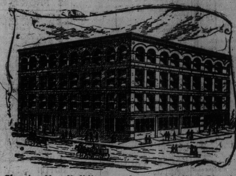
Showing New Building cor. James and Albert Streets.

As the store stands to-day it is thoroughly up-to-date with nothing overlooked that can add in any way to the comfort and convenience of shoppers. The range of stocks includes everything that sells well together for every use and taste. Every possible courtesy is extended to visitors and every possible safeguard surrounds business here. The special points of interest just now are where new goods and novelties are on dress parade. That takes account of such stocks as these: