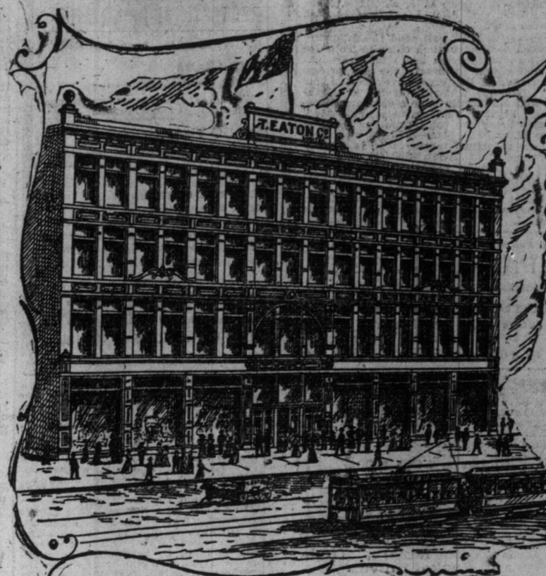
Showing New Addition on Queen Street.