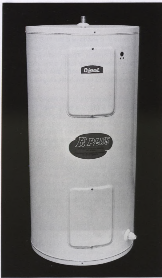
Residential and commercial Giant water heaters are economical, super efficient and reliable.

The Giant commercial electric water heaters available in capacities of up to 450-L (100-gal.) are designed for apartment buildings, office towers, shopping malls and similar applications that demand high efficiency at low cost. The commercial unit features a high silica glass-lined steel tank with thick exterior insulation; knockouts of different sizes for maximum convenience; extra large F-type junction box for easy access; a reliable high-limit control to prevent overheating; and surface-mounted thermostat to each bank of three immersed elements.