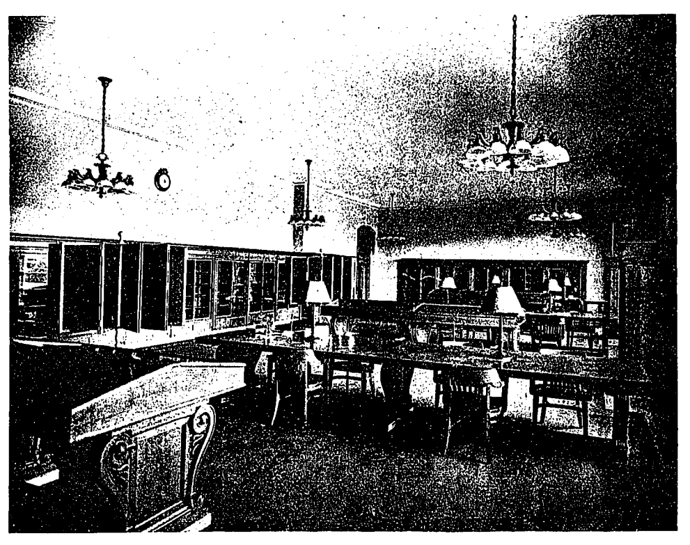
THE CANADIAN ROOM, MONTREAL PUBLIC LIBRARY.

In the periodical room the furniture consists of two large tables with bookrests for magazines, inclined shelf book-cases, newspaper table and two racks with accommodations for newspapers. The reading tables and chairs are numbered, enabling a visitor to leave an inquiry for a book at the counter to be delivered to him at one of the numbered seats at the reading table.