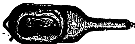
NEW RUBBER BED PAN.