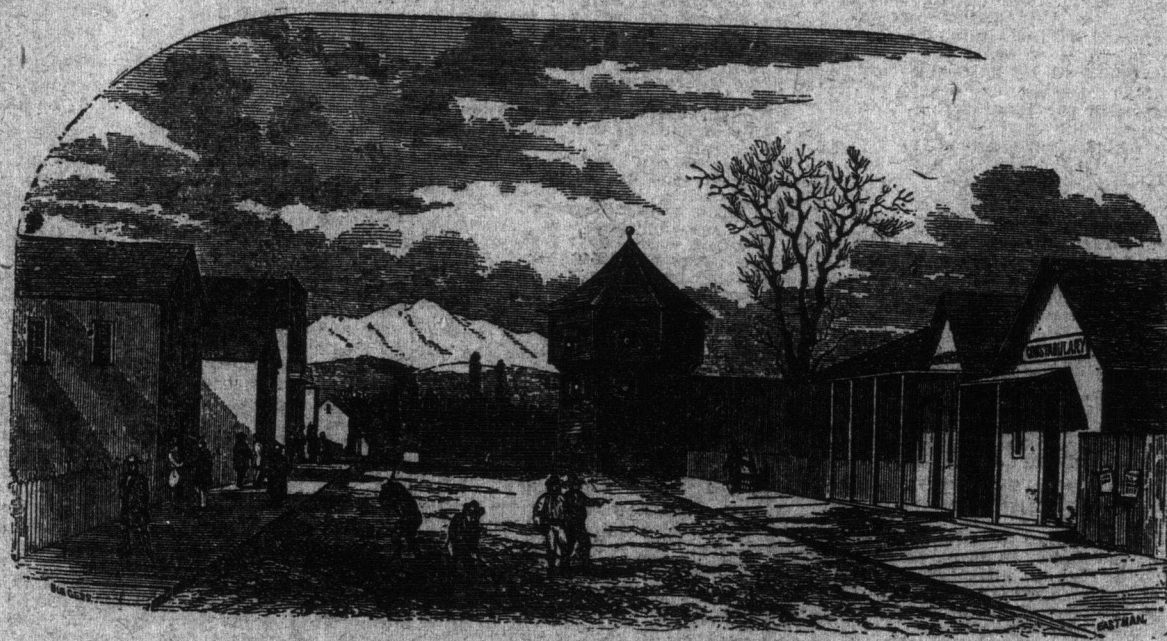
GOVERNMENT STREET, VICTORIA, AS IT APPEARED IN 1858

During the excitement quite a fleet of warships visited Esquimalt. In the meantime the Hudson's Bay Company had, in 1845, changed the name of their fort to Victoria, and as many of the streets of the city have been called after these ships, their names may be of interest. They were the Cormorant, the Fisguard, the Con-