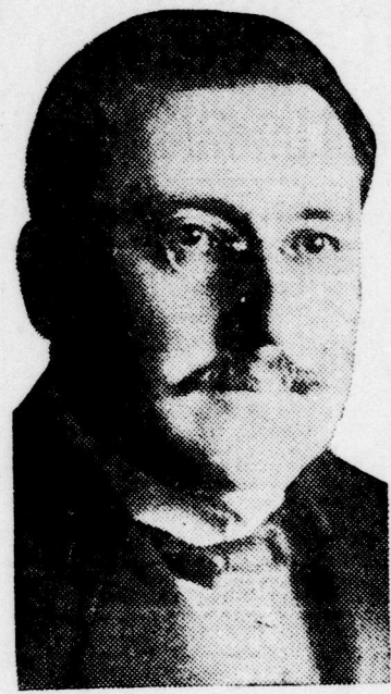
Senator Ramon Briones Luco holds the post of minister of foreign affairs in the new Chilean cabinet, which is headed by Pedro Cerda