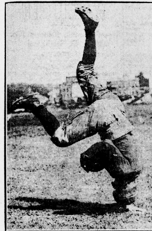
If a circus had a football team here would be a good actor. One of the players of the Columbia University squad makes a touch-down with just a trifle too much speed behind him