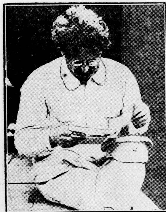
Leon Trotsky, war minister of the Russian Soviet, was snapped in this pose recently as he sat on a platform waiting to address a meeting of Red workmen in Moscow