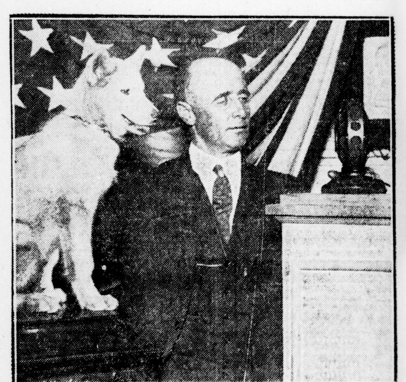
Donald McMillan, Arctic explorer, speaks through a broadcasting station in New York, in entertaining fashion, about his recent trip to the frozen north