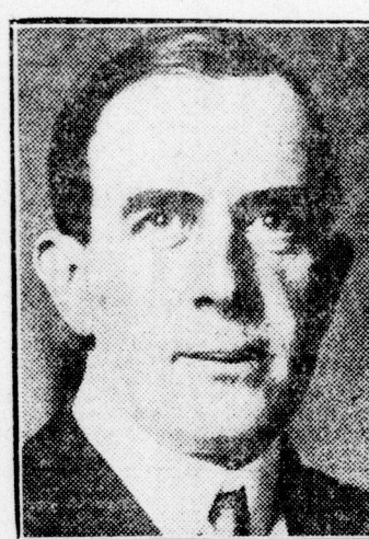
The announcement that Prince Gelasio Caetani, Italian ambassador to the U.S., will soon retire is being connected in Rome with Harry F. Sinclair's oil options in Italy. The prince says his estates need his personal management