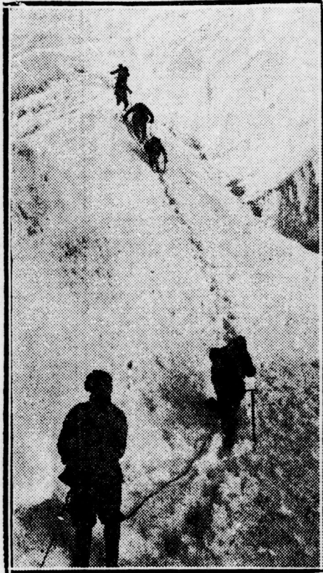
Members of the Canadian Alpine Club are shown crossing a glacier near the crest of Mount Robson, the highest peak in the Rockies, 14,000 feet above sea level