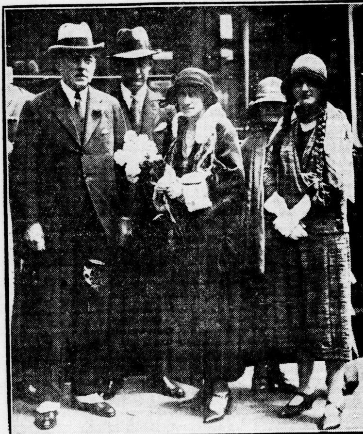
Sir Samuel Wilson, the new governor of Jamaica, left London recently with his wife and family to take over his post