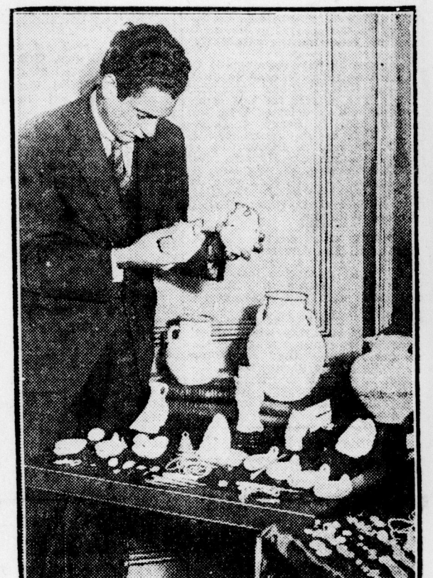
"There's nothing new under the sun" seems to get one more confirmation in the rouge and lipstick, baby's milk bottle and myriad other articles which date back 500 years before the Christian era and were found recently on the site of ancient Carthage