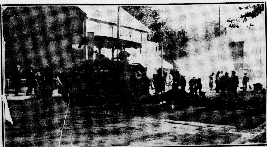
The recent paving of Elizabeth street, Barrie, Ontario, is a big improvement to the main highway from Toronto north, to Barrie, Orillia and Muskoka. The citizens held a street dance to celebrate the completion of the work