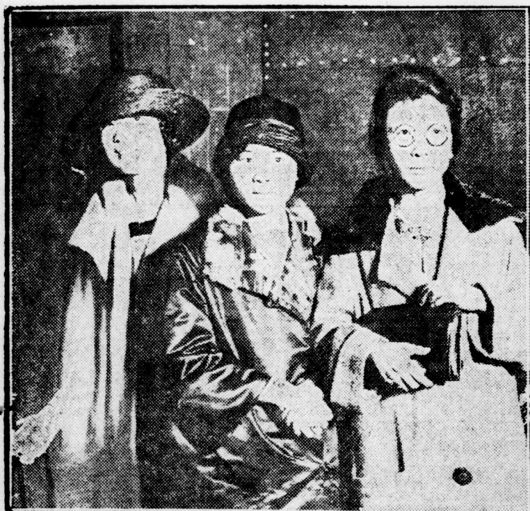
These Chinese girl students are part of a contingent of sixty graduates of Chinese government colleges, who are en route to American universities for higher education. Their expenses are provided for by the Boxer Indemnity Fund