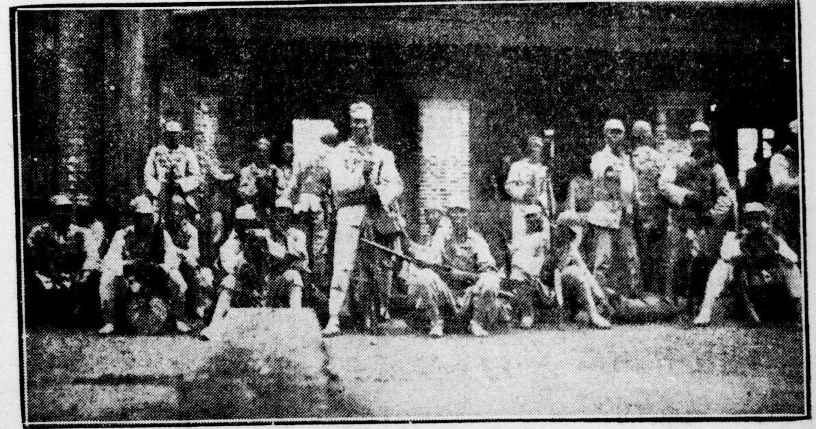
This photograph of Chekiang troops, fifteen miles from Shanghai, was made at imminent peril to the photographer's life. The cameraman did not see the soldier with his rifle aimed at him, being intent on watching the man who was reaching for a rock, which he eventually threw