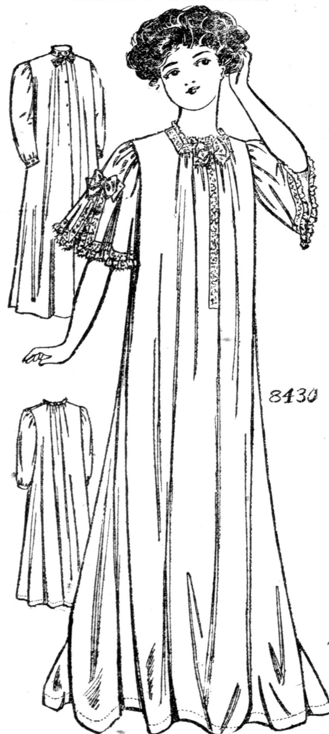
No. 8430—A Pretty Style for A Night Robe.

Ladies' Night Gown, with two styles of sleeve. Muslin, nainsook, cambric, batiste or silk may be used for this model, with lace or edging for trimming. The gown may be made with high or square neck finish and bishop or cap sleeves. The front and back portions may be gathered or tucked at the neck edges. The pattern is cut in six sizes—32, 34, 36, 38, 40 and 42 inches bust measure. It requires 5½ yards of 36-inch material for the 36-inch size.