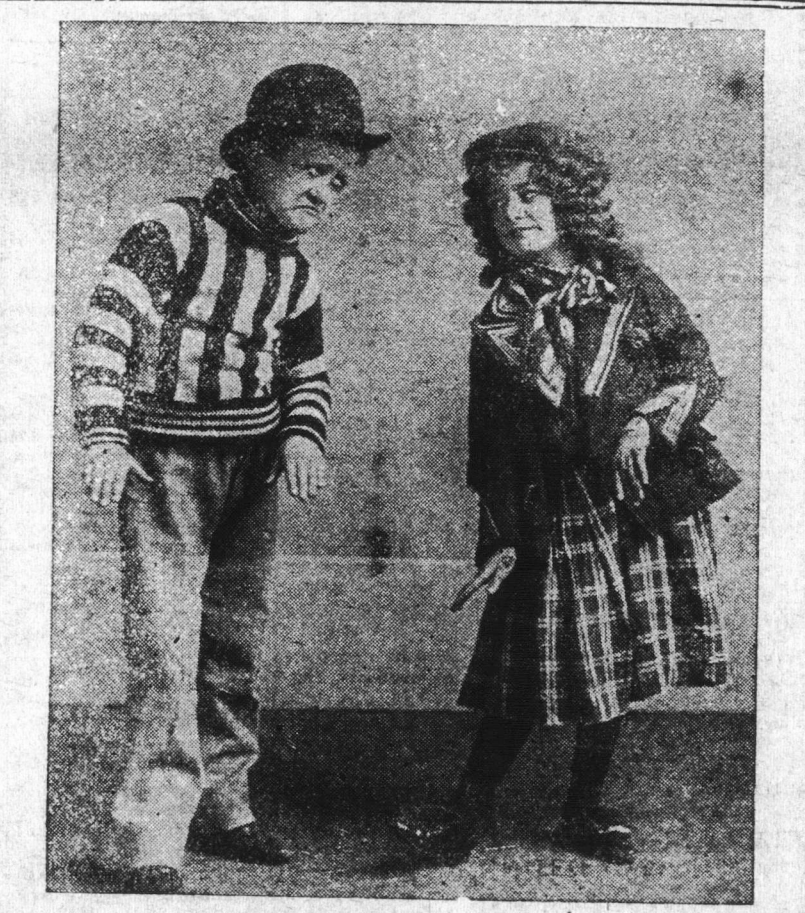
At Sherman's Lyric Theatre all This Week.

becoming. Owing to the law allowing an open season of only ten days antelopes have been so well protected that vast herds of them are now roaming all over the state. The great increase is due to the favorable conditions existing in the cactus covered plains in the eastern part of the state where the young are safe from the depredations of prairie wolves and coyotes, who will not penetrate the cactus, Quite recently in the vicinity of Wray, Akand it is no uncommon sight