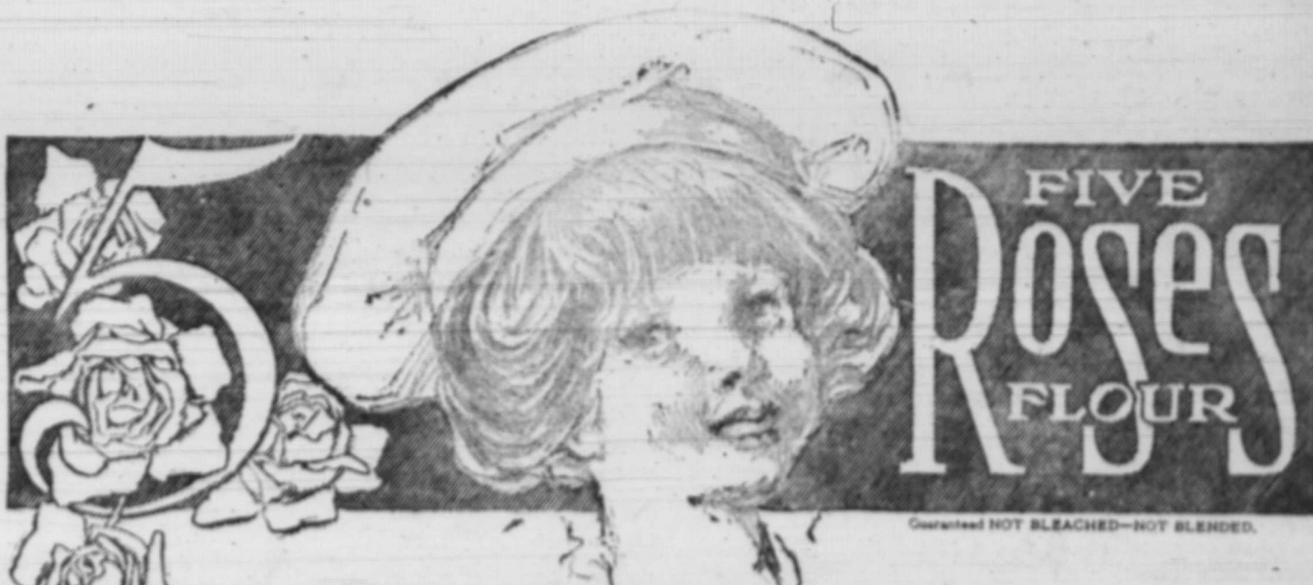
Guaranteed NOT BLEACHED—NOT BLENDING.

No discounts for time or space on any class of advertising. All changes of copy and new matter must reach us seven days in advance of date of publication to ensure insertion. Reading matter advertisements are marked "Advertisement." No advertisement for patent medicines, liquor, mining stock or extravagantly worded real estate will be accepted. We believe, thru careful enquiry, that every advertisement in The Guide is signed by trustworthy persons. We will take it as a favor if any of our readers will advise us promptly should they have any reason to doubt the reliability of any person or firm who advertises in The Guide.