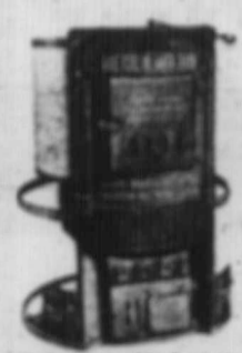
Hecla Warm Air Furnace