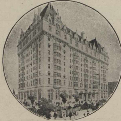
FORT GARRY HOTEL, WINNIPEG.