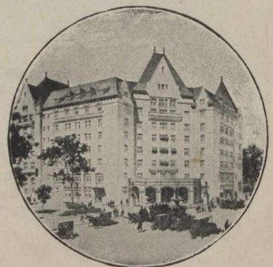
MACDONALD HOTEL, EDMONTON.

OFFICERS AND MEN OF THE CANADIAN EXPEDITIONARY FORCE can obtain RETURN RAIL TICKETS (90 days' limit) at SINGLE RATES