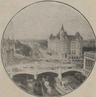
CHATEAU LAURIER, OTTAWA.