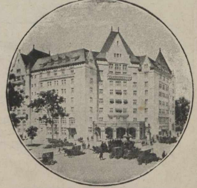
MACDONALD HOTEL, EDMONTON.

OFFICERS AND MEN OF THE CANADIAN EXPEDITIONARY FORCE can obtain RETURN RAIL TICKETS (90 days' limit) at SINGLE RATES