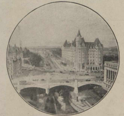
CHATEAU LAURIER, OTTAWA.