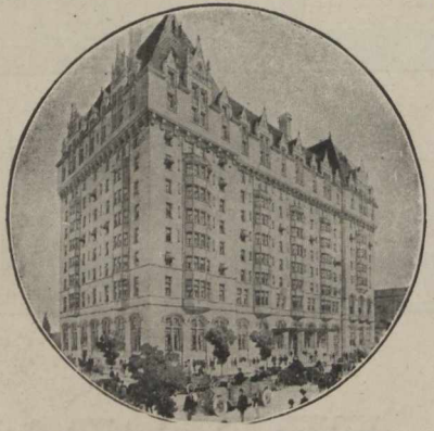
FORT GARRY HOTEL, WINNIPEG.