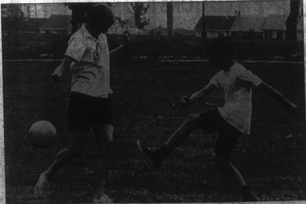
Playground soccer action.