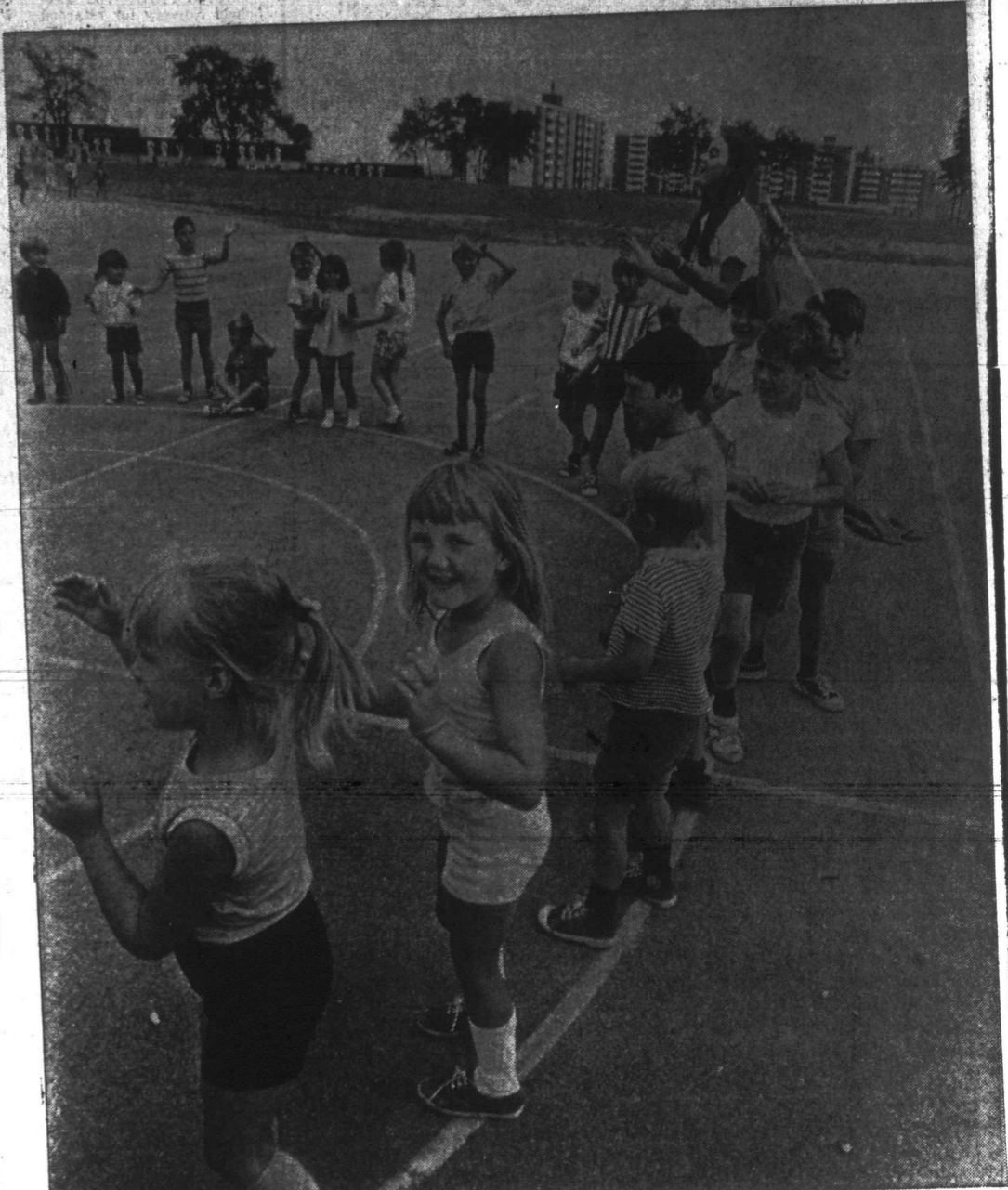
A happy circle at Havenwood Park.