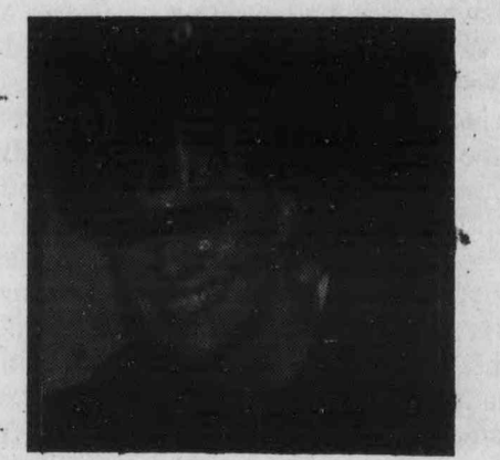
Name Withheld by Request "It depends on how long the stem is."