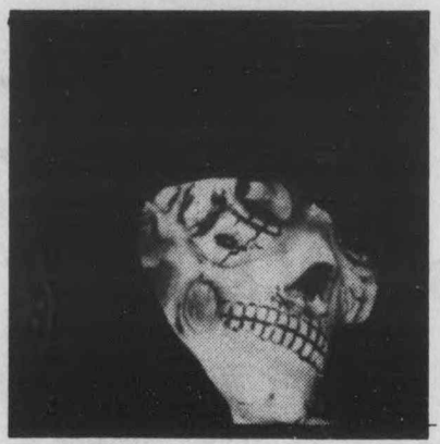
Grim Reaper "No Comment."