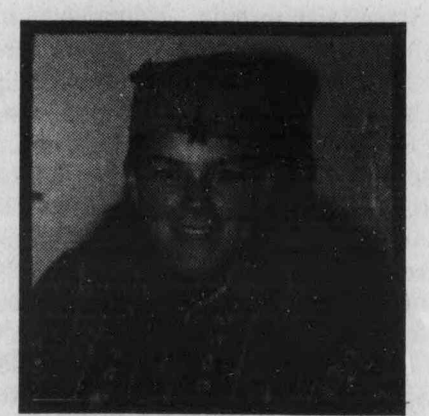
Killer Rabbit CHSR I "B, U, double N, I,E, S of Death!!!!"