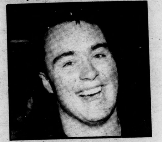
Sure! Slip one in on campus Unemployed V Chris