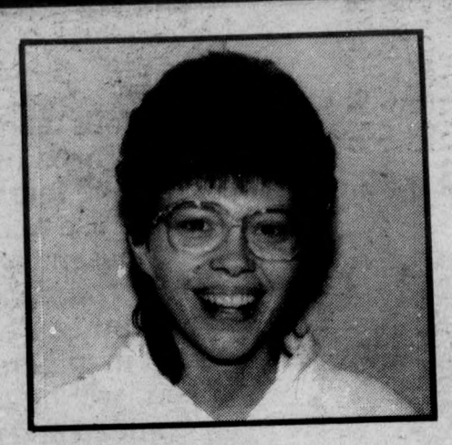
A little sex would boost everyone's morale! SUB I L.A.M.