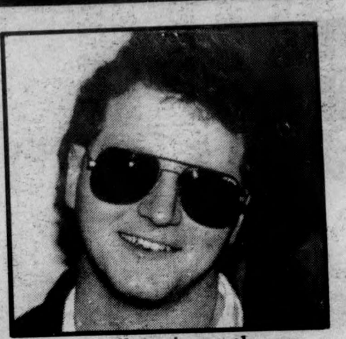
Yes, it will save me the embarassment of going to the drugstore. John Doe UNDERCOVER II