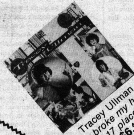
Tracey Ullman You broke my heart in 17 places $6.49