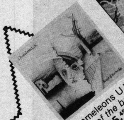
Chameleons U.K. Script of the bridge $5.49