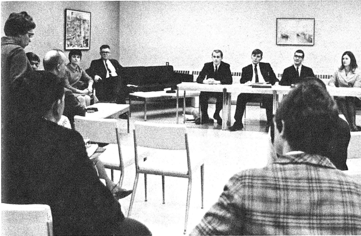
STUDENTS' COUNCIL AT MONDAY'S MEETING

. . . glamour, excitement and fun, fun, fun