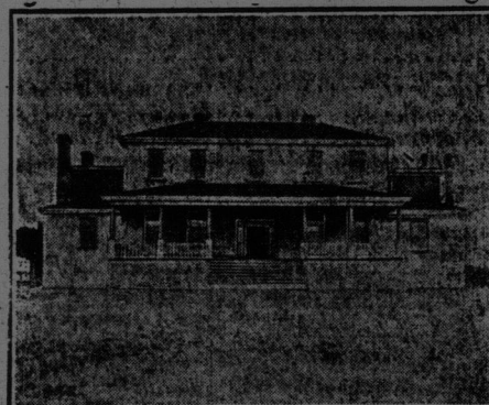
THE MANOR HOUSE

THE Old Manor House at Glen Falls, once the home of St. John's most prominent families, has been rebuilt, and will be run as a Tea Room and Restaurant. It is intended to open same to the public on or about June 19. What could be more delightful than a car ride to Glen Falls with tea or supper at the Manor House.