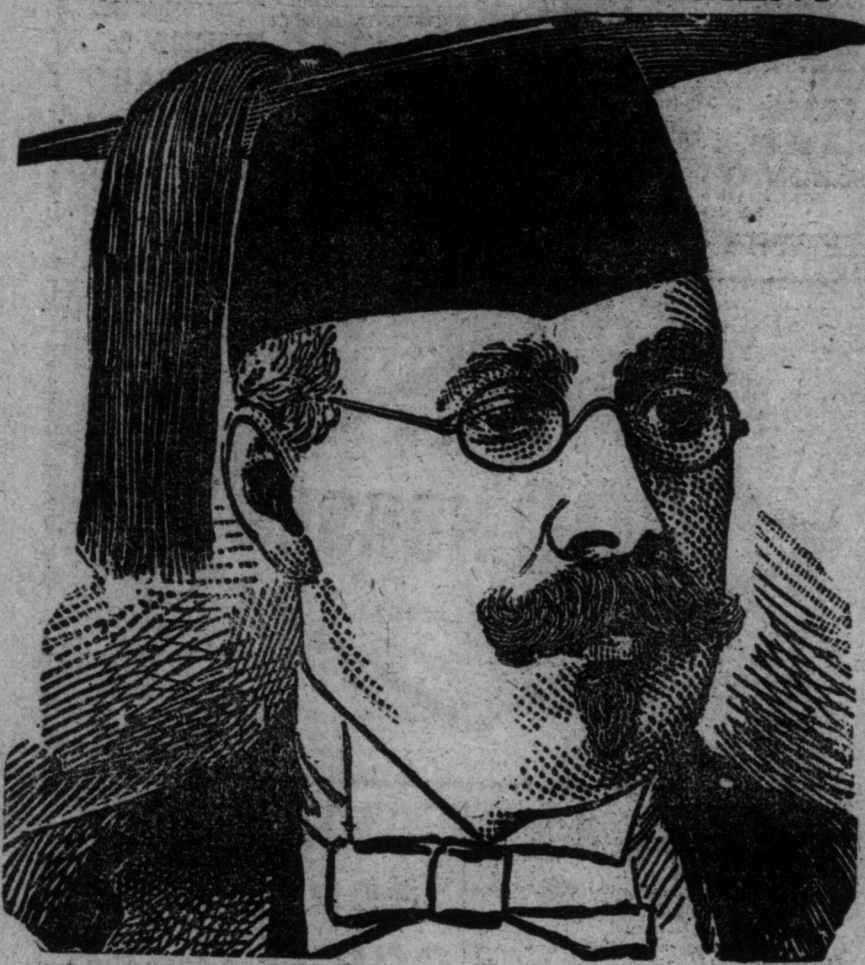
THE GREAT ENGLISH SPECIALIST Graduate in Medicine and Surgery of Dublin University, formerly Surgeon British Royal Mail Naval Service