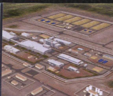
Computer-generated image of the Shchuch'ye chemical weapons destruction facility.