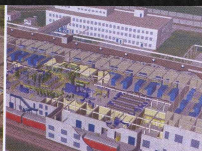
Second main destruction building