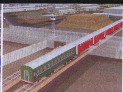
Railway entering the CWDF industrial zone and arriving at the destruction building