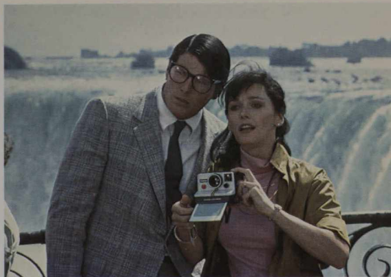
Clark Kent and Lois Lane in Superman II .

In New York the Niagara Frontier States Park Commission maintains Goat Island and Prospect Park on the mainland, which extends along the rapids in the upper river, and parks at Devil's Hole and on Grand Island.