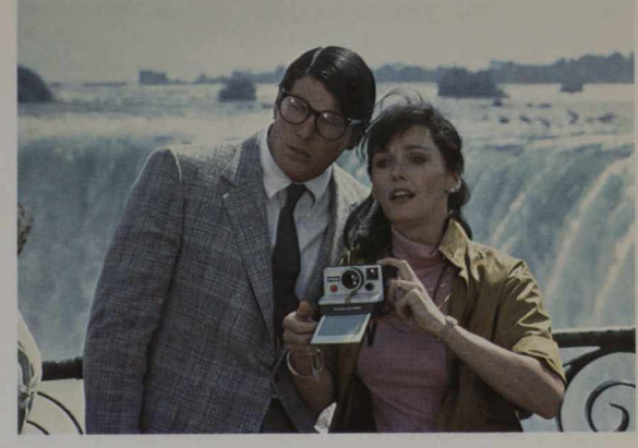
Clark Kent and Lois Lane in Superman II.

Motels compete for the honeymoon trade by offering special packages (three nights for $225, includes Love Settee, Color TV, three breakfasts and free champagne, for example). Most packages include a Honeymoon Suite and a three-hour sightseeing tour plus a genuine Honeymoon Certificate, suitable for framing. Last year 25,000 certificates were handed out. The bride also gets complimentary passes to a variety of tourist attractions. The groom does not.