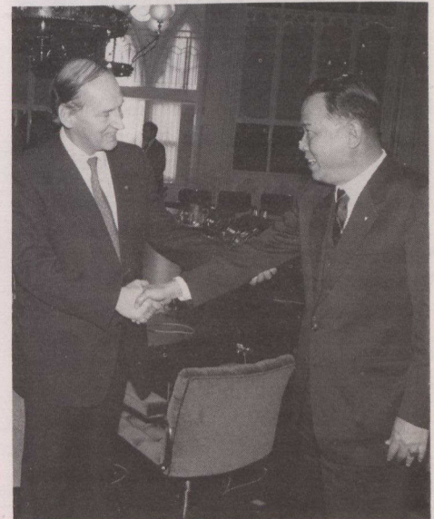
Minister of International Trade Gerald Regan (left) greets Thai Minister of Commerce Kosol Krairiksh.

On the final day of his visit, General Prem flew in a Canadian-built de Havilland Dash-7 STOL aircraft from a downtown Ottawa airport over Niagara Falls, landing at Toronto Island commuter airport. In Toronto, he met with Ontario government officials and addressed a luncheon for business executives co-sponsored by the Empire Club of Canada and the Canadian Club of Toronto.