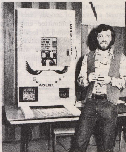
In the event of a power failure, the "gradulec" restores power gradually.

First prize ($150) was offered by Dominion Textile and second prize ($100) by Alcan. Three other prizes, of $50 each, were paid by the university's research and scholarship office.