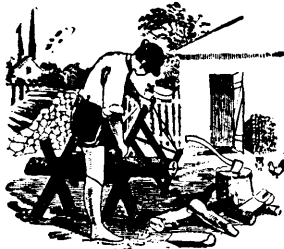
A. A. MARKS, 701 Broadway, New York.

DEAR SIR,—I have worn one of your rubber feet for over 15 years with entire satisfaction. I am a truckman and have to lift several hundredweight at a time.