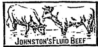
JOHNSTON'S FLUID BEEF