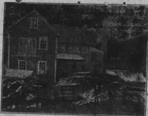
KENTVILLE PLANING MILL