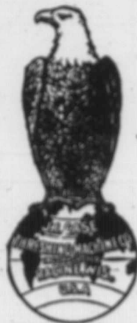
The Sign of Mechanical Excellence the World Over.

Don't buy a tractor before you've learned all about the Case. It pays to investigate thoroughly. If you're from Missouri, we "can show you."