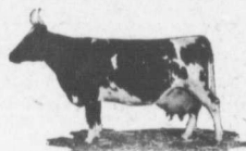
VIGOR AND PROFIT.

Quality is from year to year becoming more and more the deciding factor of every commodity the public buys. It is just as true of dairy cattle as with everything else. This largely accounts for the wonderful increase in the number of dairymen in Canada who have chosen Ayrshires as their breed—particularly in the last two years.