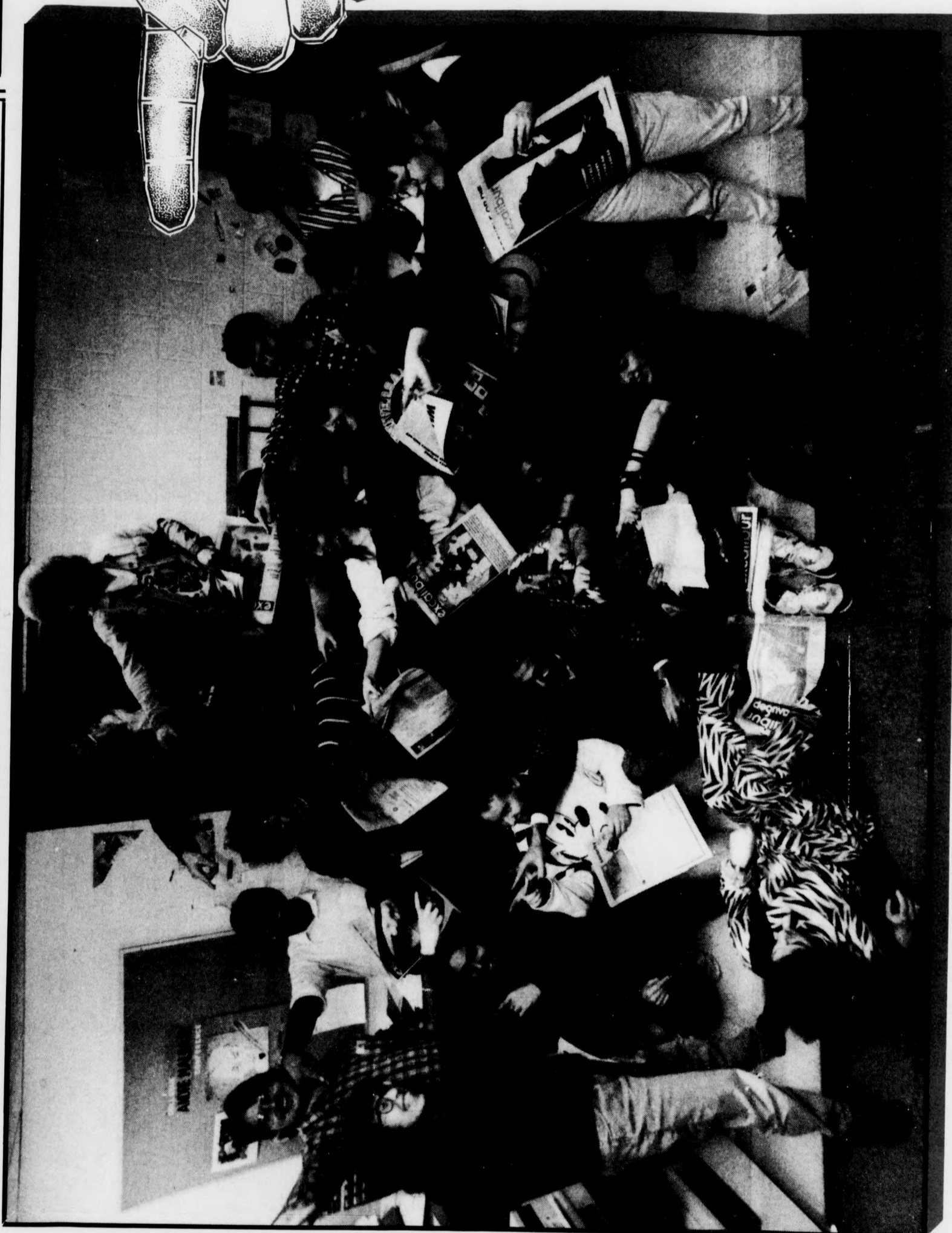
The Excal staff: