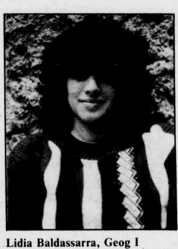
"Yes. Someone does not have the right to tell others what they can or cannot study in university."