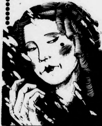
TORONTO ARTS PRODUCTIONS

12 & 1 TODAY FEMINISM AND PROSTITUTION YORK WOMEN'S CENTRE 101 B.S.B.